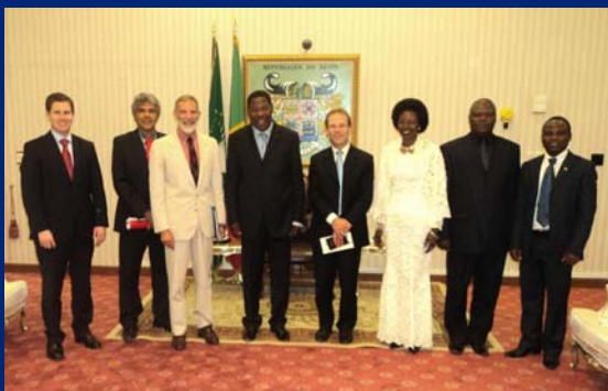
The Australian delegation during the audience with Benin President Dr Thomas Boni Yayi, August 2012