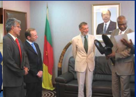
Cameroon Prime Minister Philémon Yang presenting a gift to the Australian delegation, October 2012