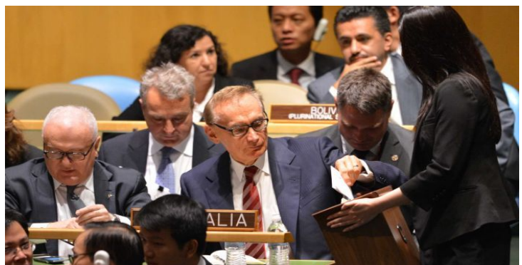
Foreign Minister Bob Carr casting Australia's vote in New York

Australia will play a constructive role across the breadth of the Council's peace and security agenda. Apart from Africa, other key priorities will include Afghanistan, Syria, Iran and North Korea. Australia will also work to ensure the effectiveness of various sanctions regimes, including those targeting individuals associated with Al-Qaida.