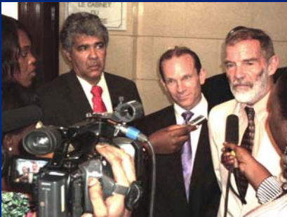
Australian delegation after meeting with Congolese Foreign Minister Basile Ikouébé, June 2012