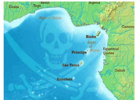
Escalating piracy attacks in the Gulf of Guinea

Australia also provided training to combat piracy during a four-week