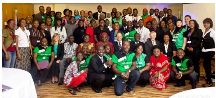
Left: Two Nigerian awardees conveying thanks to the organisers; Right: Group picture incl. representatives of the Australian High Commission in Abuja, the Australian Agency for International Development (AusAID), AAA managing contractor GRM, awardees and alumni from Nigeria, Cameroon and The Gambia as well as Government representatives from the three countries